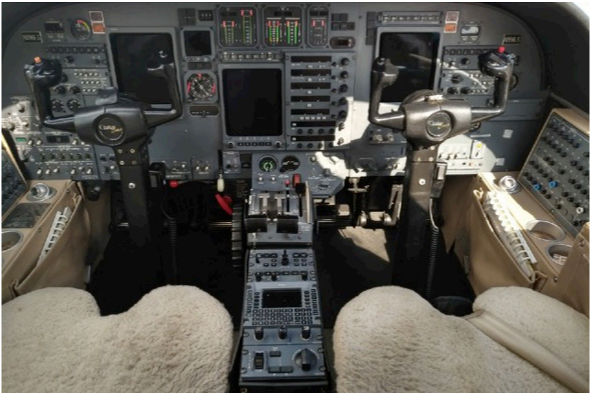
1998 CESSNA CITATION BRAVO SERIAL NUMBER: 550-8853 REGISTRATION: N398LS